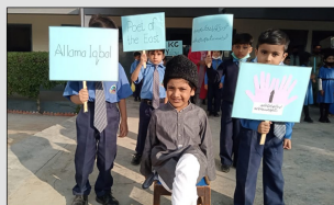
Tableau performance & speeches were presented by the students to pay tribute to Allama Iqbal "The Poet of East". It brights our young generation about his work & vision for the independence of Muslims (9th Nov Assembly presentations)